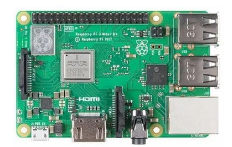
Fig. 1. Raspberry pi 3b+

the Raspberry Pi 3 Model B. It is based on the BCM2837B0 system-on-chip (SoC). The Raspberry Pi was designed by the Raspberry Pi Foundation to provide an affordable platform for experimentation and education in computer programming. The Raspberry Pi can be used for many of the things that a normal desktop PC does, including word-processing, spreadsheets, high-definition video, games, and programming. USB devices such as keyboards and mice can be connected via the board's four USB ports.