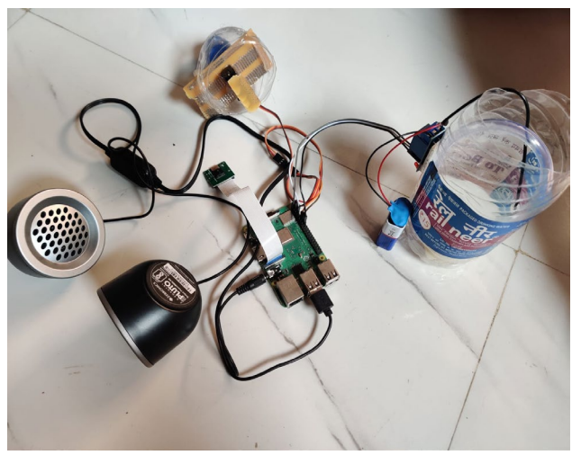
Fig. 8. Working model (Result)

Firstly, we have to give input to the software called VNC Viewer. Now from the given input, the raspberry pi 3B+ dispenses water using pump which is connected to relay 1 channel. Also, raspberry pi 3B+ opens lid of food container using servo motor. Now to put IP address of raspberry pi 3B+ in the url section for the live surveillance through camera module. Finally, we can feed our pet as well as can keep watch on them.