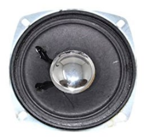
Fig. 6. Speaker

The purpose of speakers is to produce audio output that can be heard by the listener.