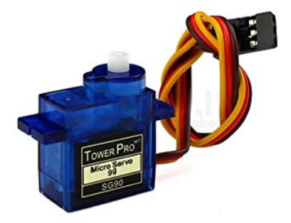
Fig. 4. Servo motor

great precision. If you want to close or open object at some specific angles or distance, then you use a servo motor.