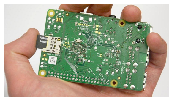
Fig. 3. SD card

The SD card is a key part of the Raspberry Pi; it provides the initial storage for the Operating System and files. Storage can be extended through many types of USB connected peripherals.