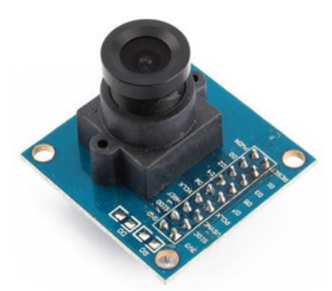
Fig. 2. Camera module

The Camera Module 2 can be used to take high-definition video, as well as stills photographs.