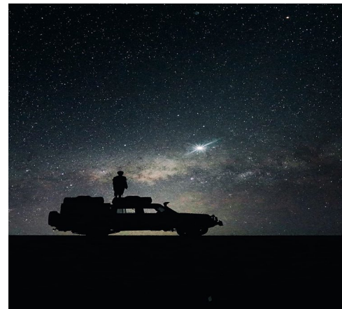
Fig. 2. Have you ever thought or imagined a universe without you and Allah after 1 billion years? Muslim youths may not but youths with scientific worldview do imagine in that sort of universe

We can observe the evolution of thought on the question of the meaning of life in scientific worldview. Islamic Worldview offers the meaning of life within centralized system that revolves around Tawhid. Hence, One curious Muslim youth and One curious religionless youth can observe the same sky, but one sees the beauty of universe from the Tawhidic paradigm and another observes the beauty of universe from scientific paradigm. Both youths would be lost in time and millions of years both are forgotten, maybe by that time our solar system will pass few galactic years.